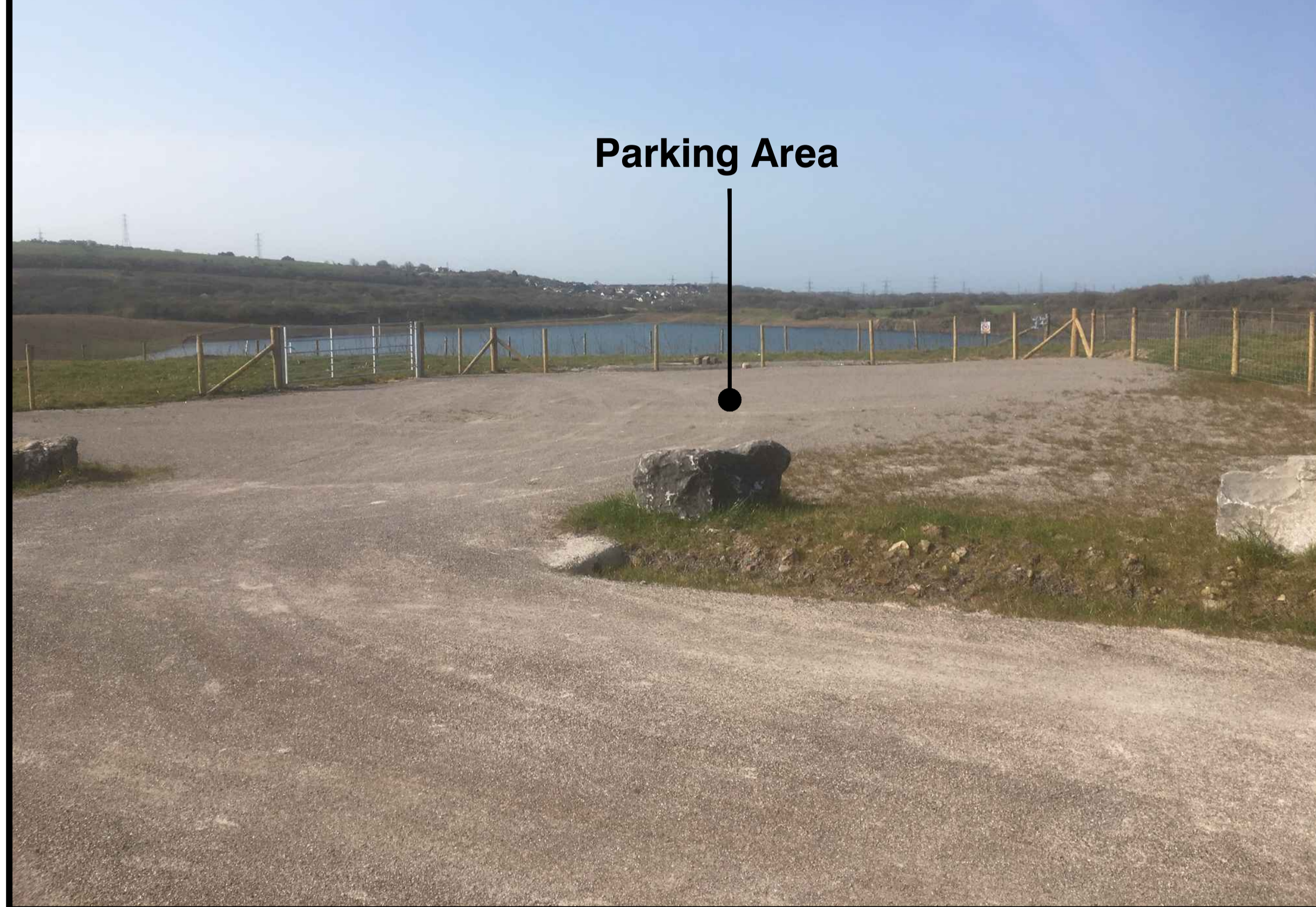
Typical Car Park Layout