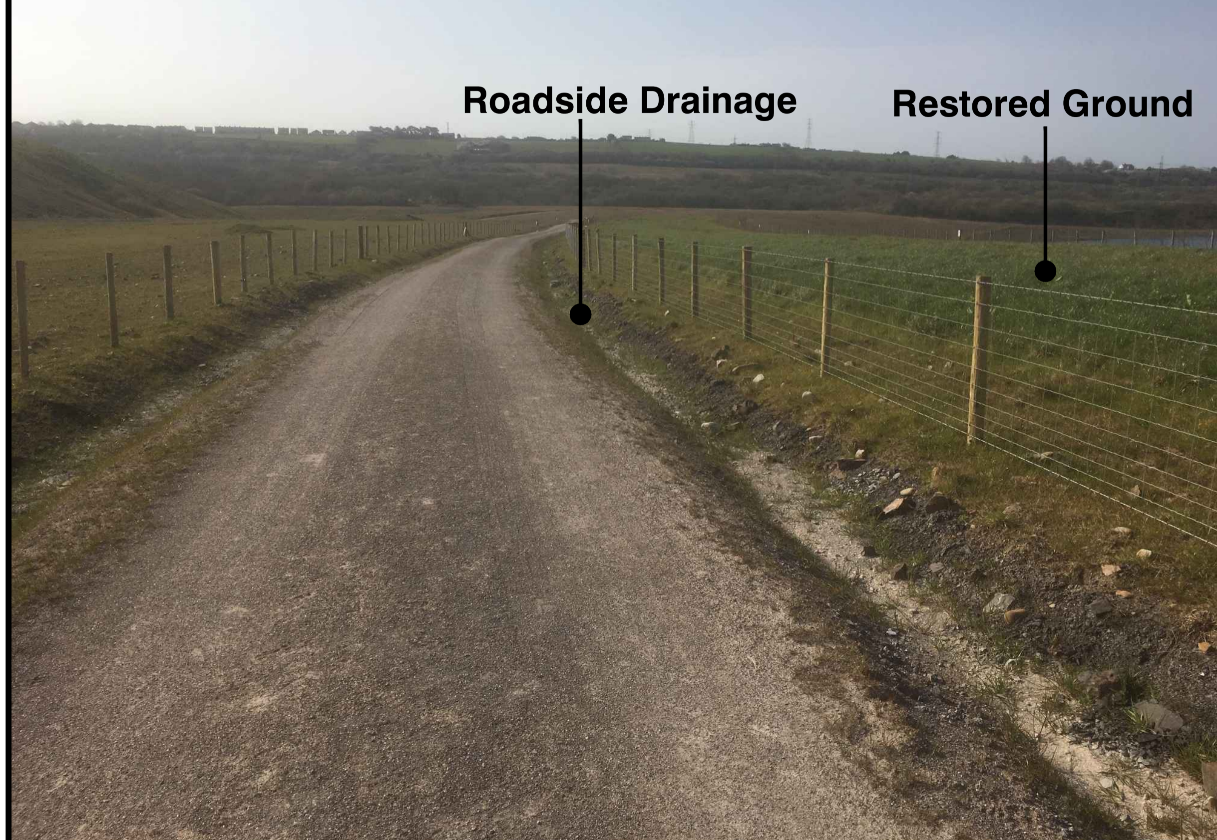
Road Layout Illustration